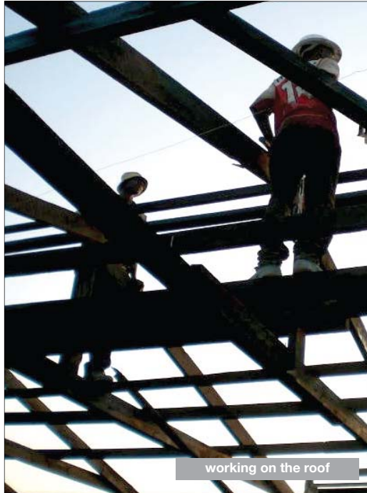
working on the roof