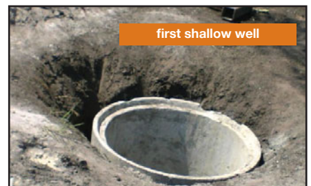
first shallow well

The whole agric team and a Director driver spent a day two hundred kilometres south at a research farm. All are converted to conservation farming which is highly appropriate in these days of global warming. It will take a while to get the old style farming out of the system, but this visit has encouraged our team to start up demonstration of various methods and crops to improve production and save the land and water. We are going to introduce drip irrigation and have raised seedlings of trees to be planted between the rows which will fix nitrogen to minimise the use of artificial fertilizers ■