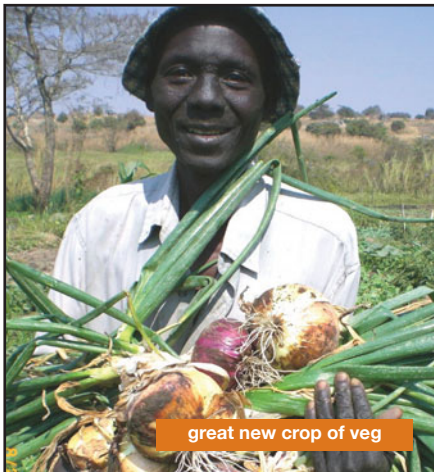
great new crop of veg