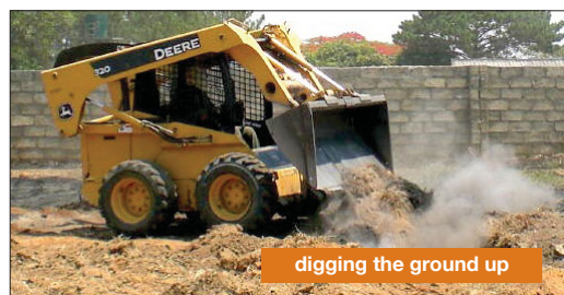
digging the ground up

A Methodist mission not far out of town have very kindly come to the Isubilo Centre with their mini-front end loader to turn the rather long lived building site around the Children and Youth Centre into flat grassable land for sports. This is not before time! We are looking forward to planting grass this rainy season giving an area to build outdoor shelters for games and the young people much more room to play sports such as basket ball and volley ball. We hope that by next year we will be able to develop a strip of land behind the Centre for football ■