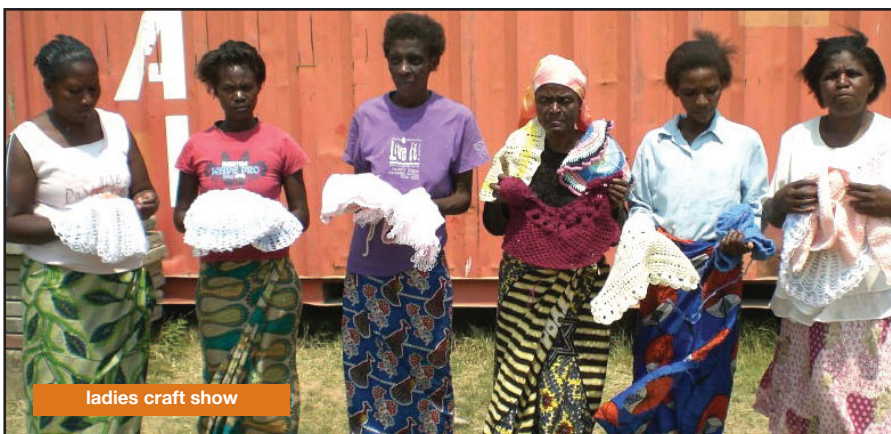
ladies craft show

Some of our ladies have chosen to use their knitting, crocheting and sewing skills to help with their living expenses. We have been able to give them a good selection of raw materials such as cotton and wool kindly sent out by donors from England. They were very proud to show us some of their creative work before it goes on sale ■