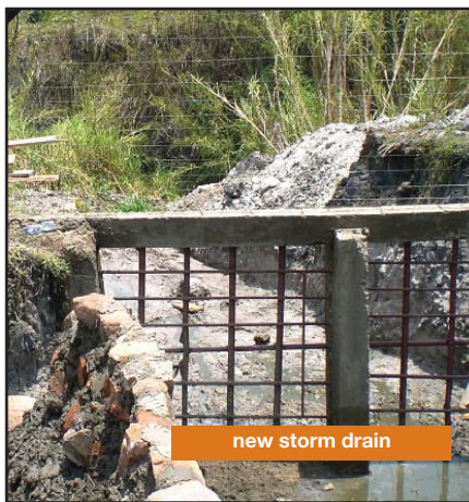
new storm drain

With the help of a donation, and a discount price from the distributor, we were able to purchase a high canopy for the new pick-up we recently acquired. We are grateful to ensure dry journeys for our disabled and sick clients just as the rains are about to start ■