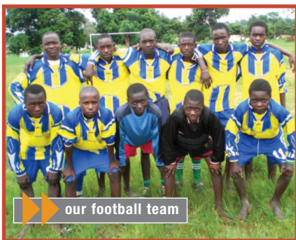
our football team