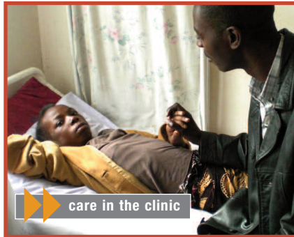
care in the clinic

Eight of our CY (Children and Youth) have finished secondary school - grade 12 and are waiting for their results. In the usual manner they will only get their results when it is too late to apply for further education or skills courses. A whole year will have to elapse before they are to able to apply during which Isubilo will try to keep them occupied and advise them into the next stage of their lives. They will help in the CYC (Child and Youth Care) department in different capacities as well as spend times with other departments to gain experience of different life disciplines ■