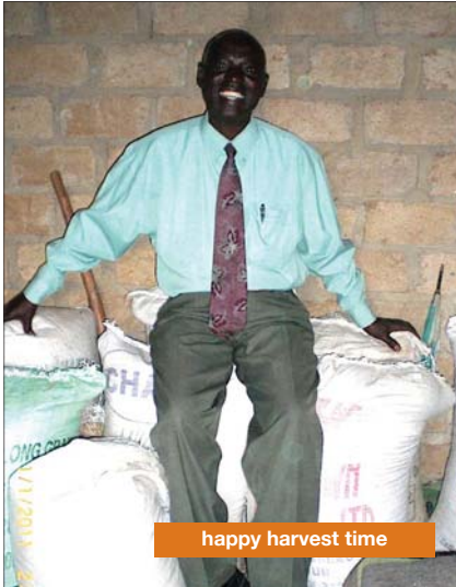
happy harvest time

This year Isubilo, with the help of Willow Creek Community Church, is involved in the training of ten local pastors and church leaders. They started with the loan of seed and fertilizer to grow a quarter of a hectare of maize each which they have successfully grown and harvested. They are thrilled with the results. This has given them food security as they are not very well supported. They are also an example to their churches and can teach the skills they have learnt under the Agric team's supervision ■