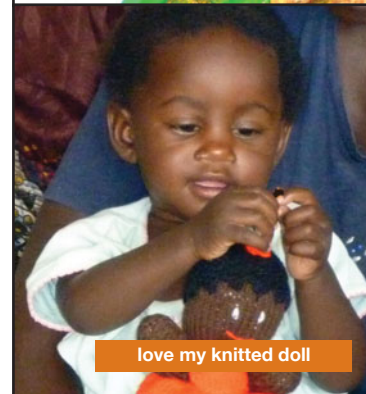
love my knitted doll