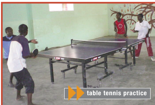
table tennis practice