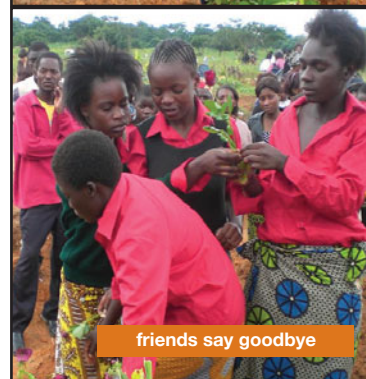
friends say goodbye