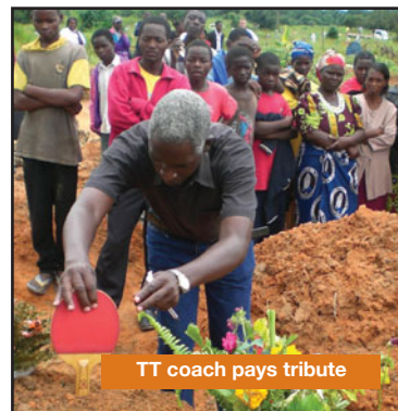
TT coach pays tribute