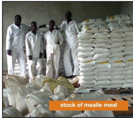
stock of mealie meal

Three years or so ago Tanga took on the responsibility of growing some moringa tree seedlings. These trees are sometimes called miracle trees as every part of them are useful, much being of medicinal benefit. We are pleased to see that the dried, powdered leaves are more and more in demand by our clients who mix them in their porridge and other food resulting in noticeable reductions in skin rashes and increase in general health due to the immune boosting properties. Our staff promote the use of these leaves and clients are encouraged to grow their own trees from our seedling though Isubilo now has a small grove of trees at the farm ■